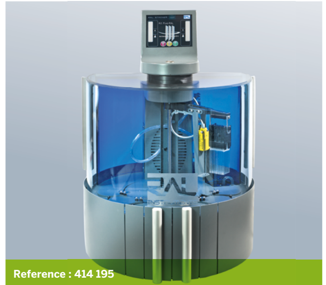
Reference : 414 195