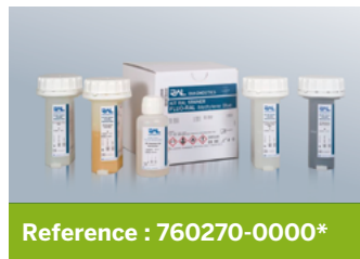
Reference : 760270-0000*